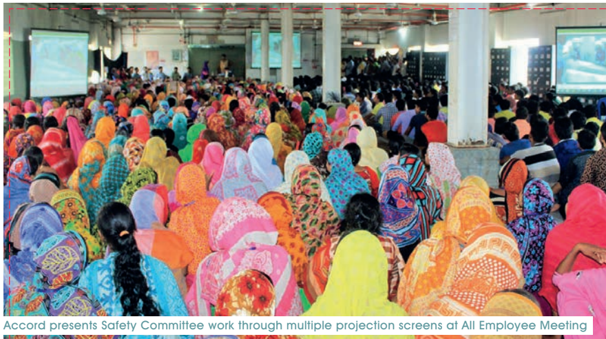
Accord presents Safety Committee work through multiple projection screens at All Employee Meeting