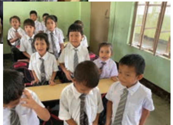
Nursery students at Our Lady of Holy Cross School in Barakathal, India