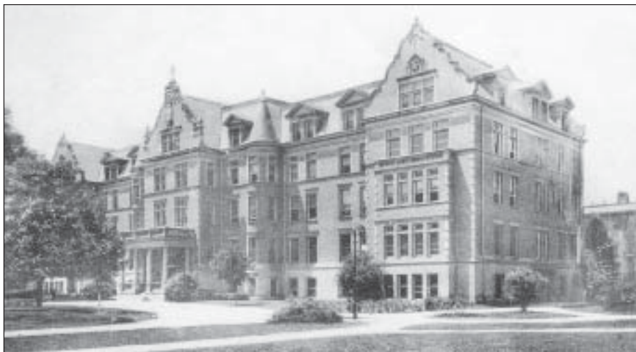
Holy Cross Hall, erected 1903, Saint Mary's College, Notre Dame, Indiana

daughters, which they did in September with the approval of Sorin. That small school, the first of many, became the well-known Saint Mary's College, Notre Dame, Indiana. The sisters also began to teach some local orphans and deaf children, and in 1845 two of them went farther north because a Holy Cross priest asked them to teach some Potawatomi children at his mission in what is presently Silver Creek, Michigan. In 1850 the sisters and brothers established a school in St. John, Indiana, to teach the children of German immigrants. This was the first non-Indian mission in Indiana outside the Notre Dame-Bertrand axis. Their original purpose had truly broadened considerably in response to the needs of the time and place. Their ancillary services continued in their own schools and at the University of Notre Dame.