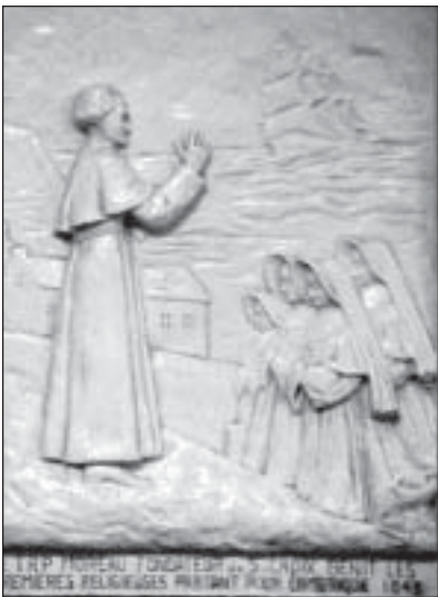
Father Moreau blesses sisters who were missioned from France to North America in 1843. (bas relief sculpture, Congregational Archives)

The people of the town asked them to open a school for their