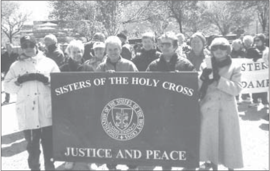
Sisters rally for debt relief, Washington, D.C., 2000.

address issues systemically, and to do so from a global perspective. In 1996 a sister was assigned as full-time head of the Congregation Justice Office.